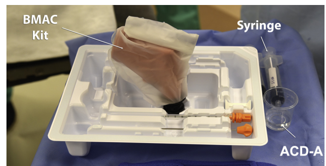
Fig 2. Photograph illustrating the bone marrow aspirate concentrate (BMAC) kit: bone marrow aspiration needle, trochar, a 30-mL syringe and the ACD-A solution. (ACD-A, anticoagulant citrate dextrose solution, formula A.)

Video 1 outlines the entire described technique, beginning with patient positioning, and concludes with intra-articular injection of BMAC.