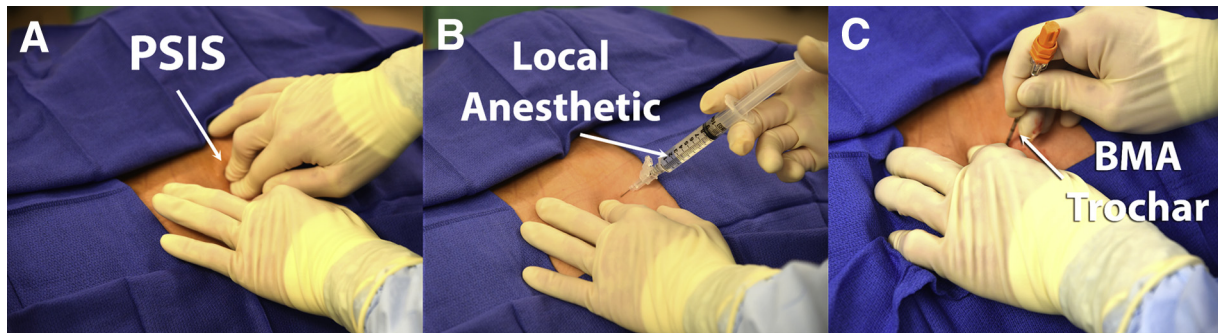
Fig 3. Patient placed in the prone position: (A) palpation of the left posterior superior iliac spine (PSIS), (B) infiltration of local anesthetic in the trajectory of the harvesting, and (C) percutaneous insertion of the bone marrow aspiration (BMA) trochar parallel to the iliac crest.