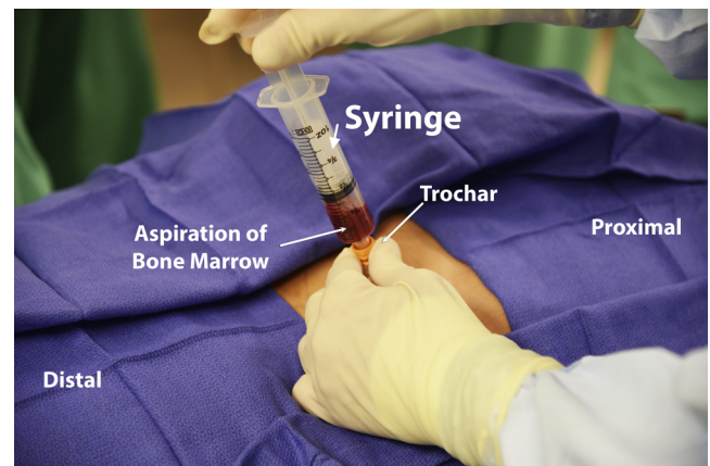
Fig 5. Aspiration of bone marrow on a left posterior superior iliac spine; the bone marrow aspiration needle is inserted into the cancellous bone of the iliac crest after penetrating the cortical bone using a power drill and the sample is obtained.