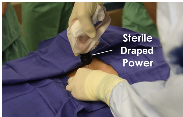
Fig 4. A sterilely drapped power instrument being used to advance the trochar through the dense cortical bone (left PSIS) into the medullary cavity of the posterior iliac crest. Needle trajectory should be perpendicular to the PSIS. (PSIS, posterior superior iliac spine.)

Use of BMAC in patients with focal chondral defects and/or OA in the knee has been scarcely delineated. Three recent studies showed BMAC to be moderately effective in the treatment of OA. 21,24,25 These studies used different outcome scores and treatment protocols, making inter-study analysis difficult. One of these studies, by Hauser and Orlofsky, reported improved symptoms and quality of life scores after injection of 2 to 6 injections of BMAC at 2- to 3-month intervals. 25 This study highlights a potential treatment regimen of 2 to 6 injections over a 3-month period for the treatment of patients with OA. 25 Furthermore, BMAC application has