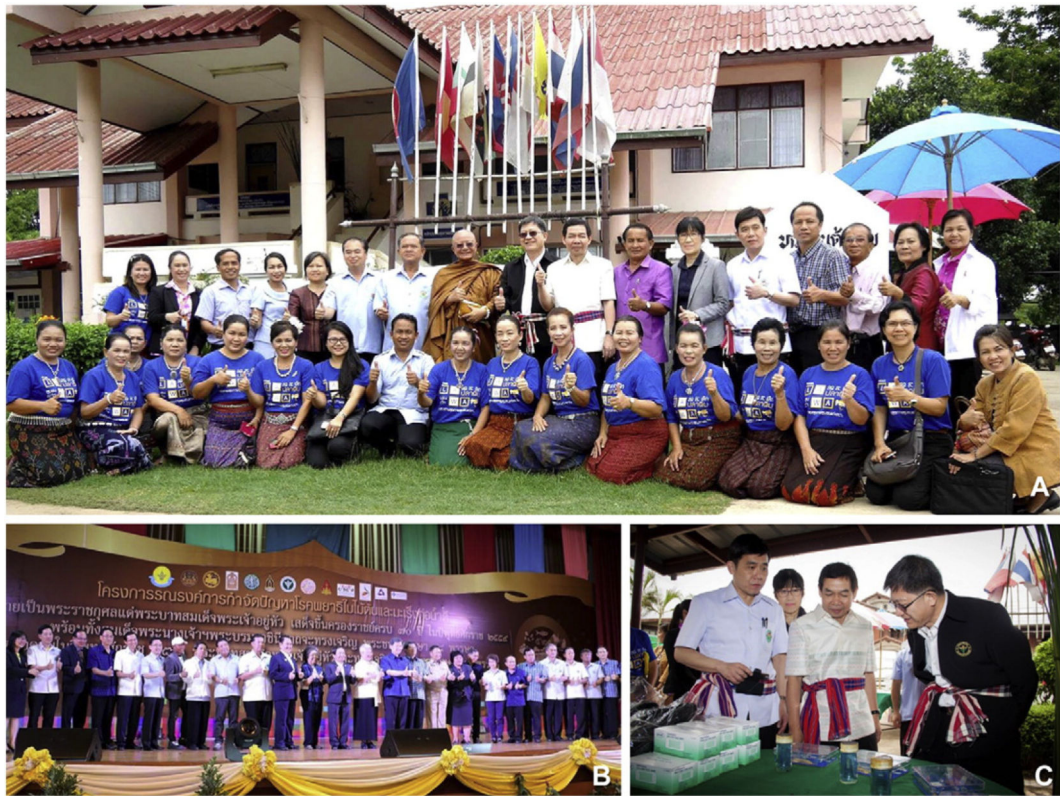
Fig. 6. Policy makers and Lawa model. Director General of Department of Disease Control, Ministry of Public Health, Thailand and team visited Lawa model (A,C). Liver fluke and cholangiocarcinoma kick-off ceremony in Sakolnakhon Province, January 2016 (B).