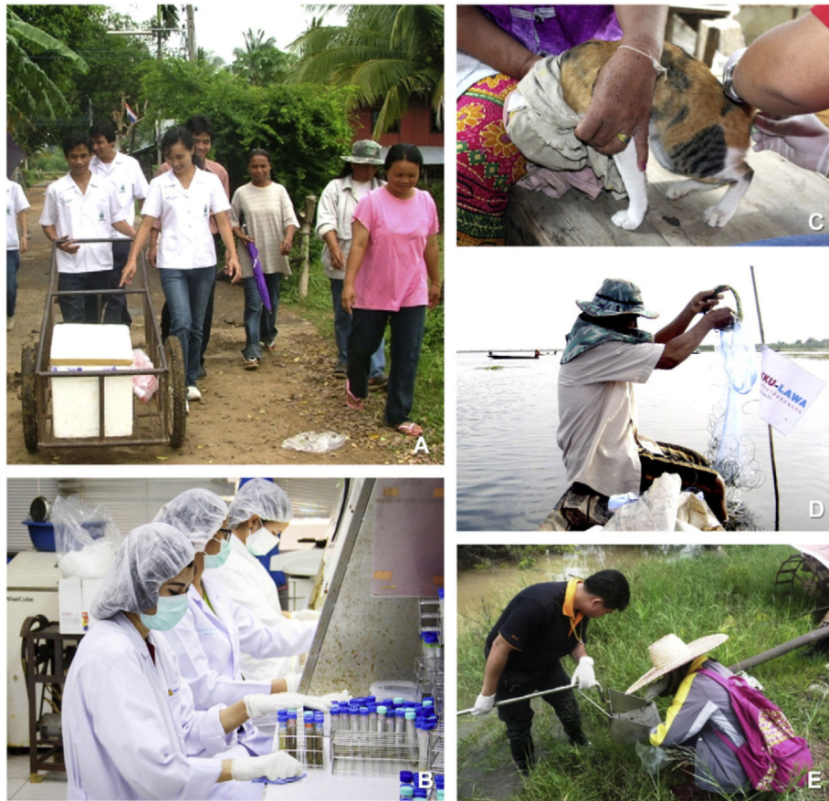
Fig. 2. Baseline survey for O. viverrini infection in humans (A), animal reservoirs (B) and intermediate hosts (D,E) are performed and samples are sent to the laboratory for investigation (B).