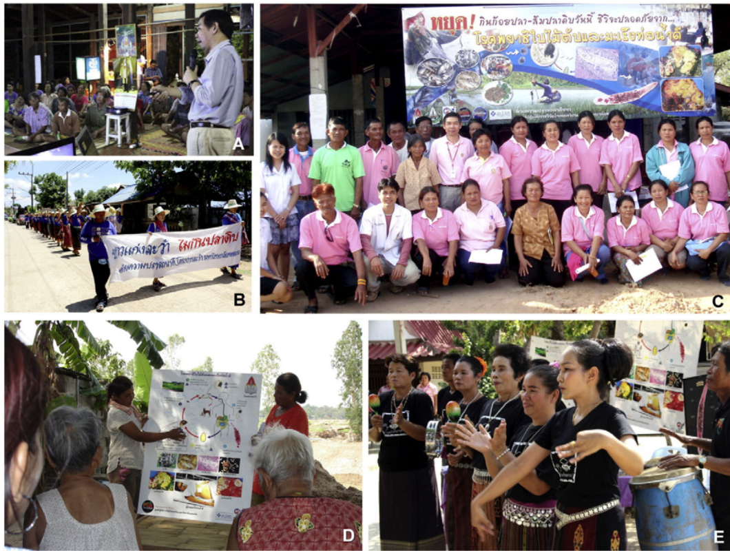
Fig. 4. Information, education and communication (IEC) or Behavioral change communication (BCC) in the Lawa model campaign. Our research team lead by Dr. Banchob Sripa gives a twilight education on the background of liver fluke infection and CCA (A). Community activation by our village health volunteers (B). Empowering village health by intensive on-day training (C) and they will translate the knowledge in a simple way to villagers by door-to-door education (D) and edutainment (E).