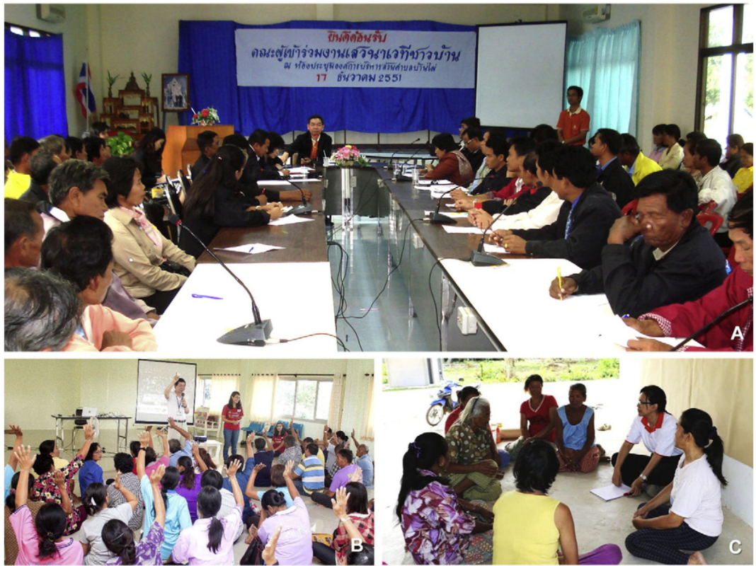
Fig. 3. Stakeholder meeting and community engagement (A, B) on the basis of equality in the friendly atmosphere of a small group discussion (C) is important for making decisions and maintaining strong commitments in community participation.