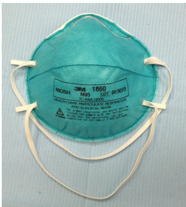
Figure 2 - The N95 respirator.

are also prone to MERS-CoV infection. As the number of MERS-CoV cases may increase in future, pediatric dentists should be well informed and educated about not only the signs and symptoms of the condition but also how to follow stringent infection control measures in these cases.