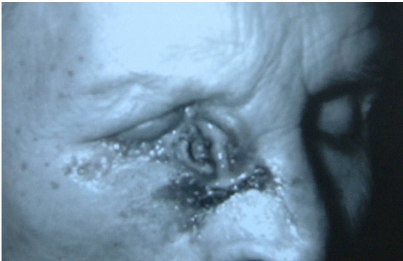
Figure 1 Giant BCC located on the inner canthus

commonly appear on the trunk and display a more aggressive behavior, resulting in local invasion and metastasis. The reported incidence of metastatic BCC ranges from 0.03 % to 0.55 [5]. We report a case of simultaneous lung and parotid gland metastases of giant BCC located on medial canthus.