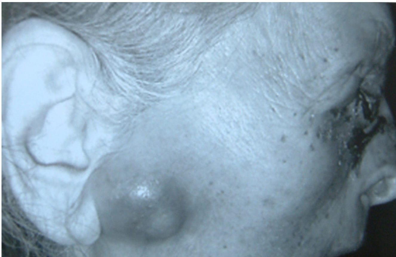
Figure 2 Involvement of the parotid gland of the patient

Examinations of the cardiovascular, gastrointestinal, neurological, urogenital and hematological systems and other parts of the skin were performed by physical and routine laboratory and radiological techniques. There were no abnormal findings. Biopsy was performed from the tumor located on the inner canthus and revealed "adenoid basal cell carcinoma" (Figure 4). Also, Fine needle biopsies were performed on the parotid and pulmonary lesions which confirmed the presence of adenoid BCC in these regions.