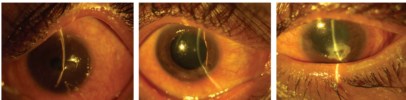
[Table/Fig-3]: Left eye on slit illumination showing flat anterior chamber. [Table/Fig-4]: Showing right eye on day 7. [Table/Fig-5]: Left eye at day 7 showing cyanoacrylate glue sealing the perforation and well formed Anterior Chamber (AC).