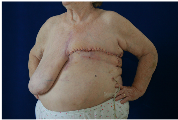
Fig. 3 Condition after mastectomy with a fish-shaped incision