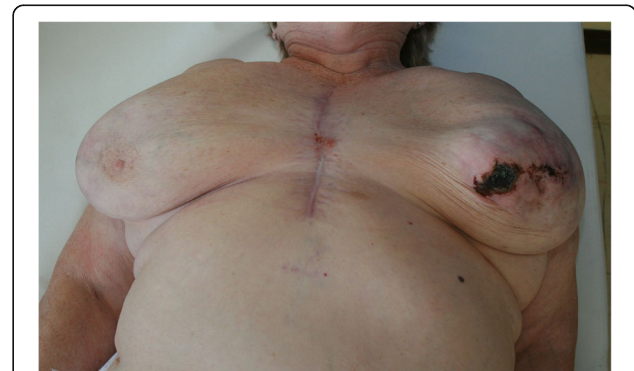
Fig. 2 Clinical findings at the time of diagnosis

Five weeks after the mastectomy, the patient's condition was generally better; she was optimistic and experiencing no pain. The mastectomy wound had healed up, and the patient was referred to her general practitioner with no need for future oncological check-ups.