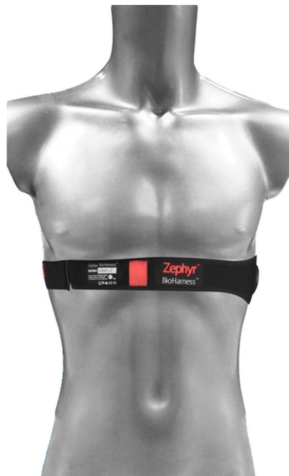
Figure 1. Zephyr BioHarness.

Activation of ECG, BioHarness, and calorimeter data logging followed a standardized procedure to ensure accurate data synchronization. Data were recorded during 180 seconds of seated rest prior to, and throughout exercise. A 60-second transition period was included prior to locomotive exercise to enable treadmill initiation.