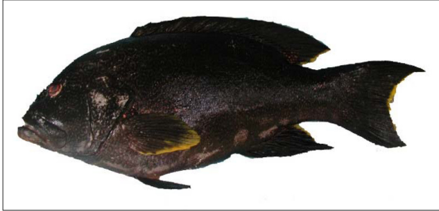
Figure 2 Oplegnathus punctatus . The fish inhabits rocky and coral reefs in Pacific Ocean.

body and antinuclear antibody were negative. Based on ACR/EULAR classification criteria, the patient was diagnosed with RA and referred to a local general hospital for further investigation. Joint ultrasound revealed an enhancement of blood flow signal in the right fifth metacarpophalangeal joint and bilateral wrists (Figure 3). No abnormalities were seen on plain radiographs of the hands and chest. His symptoms were controlled with salazosulfapyridine 1000 mg.