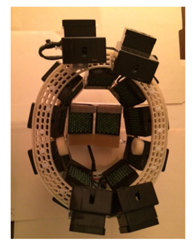
Actual NIR Phototherapy Study Design