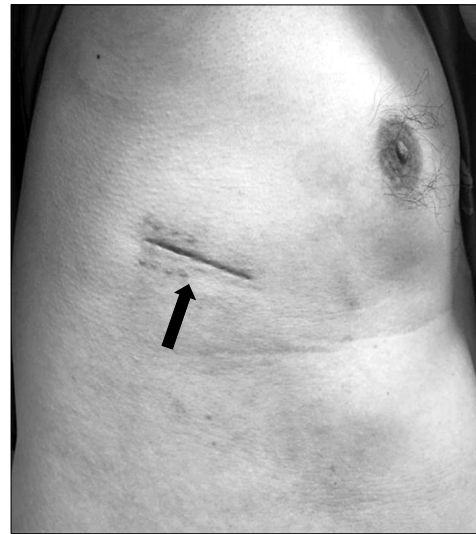
Fig. 1. Skin incision 1 month after the operation (arrow).

A 5-mm, 30° thoracoscope (Karl Storz endoscope;