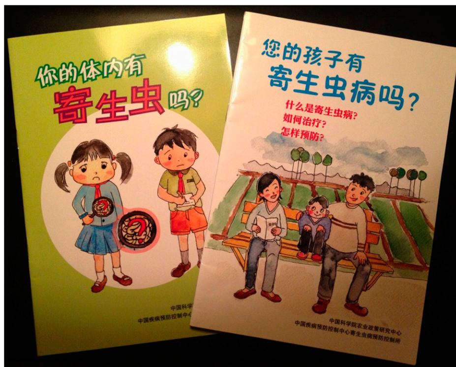
FIGURE 3. Covers of soil-transmitted helminth educational pamphlets.

surveys and fecal sample collection were performed in April 2014. All children who were randomized to the control group of our study received albendazole after the conclusion of the study in April 2014 (Figure 2).