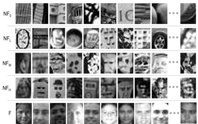
Fig. 1. Sample stimuli used in our studies. Rows are arranged in order of increasing face semblance, with genuine faces at the bottom. The full stimulus set comprised 300 images and was divided into five equal-size groups labeled NF_0 (randomly selected nonface images), NF_L , NF_M , NF_H [false alarms of a computational face detection system (43) with low, medium, and high face semblance, as determined by human raters and computational metrics (41)], and F (genuine face images).

The stimulus set we used for assessing face/nonface categorization has been described in detail in Meng et al. (41), and has proven effective for exploring face classification in behavioral studies, as well as in those using neuroimaging and electrophysiological tools (42). Briefly, this set comprises 300 natural images that span a range of facial semblance from nonfaces to genuine faces. These images include true hits and false positives from a computational face detection system developed at Carnegie Mellon University by Rowley et al. (43). Based on human and computationally derived ratings of face semblance, the stimuli are divided into five equal-cardinality nonoverlapping bins ( NF_0 , nonfaces; NF_L , low face semblance; NF_M , medium face semblance; NF_H , high face semblance; and F, faces). The five bins do not differ from each other in the spectral composition