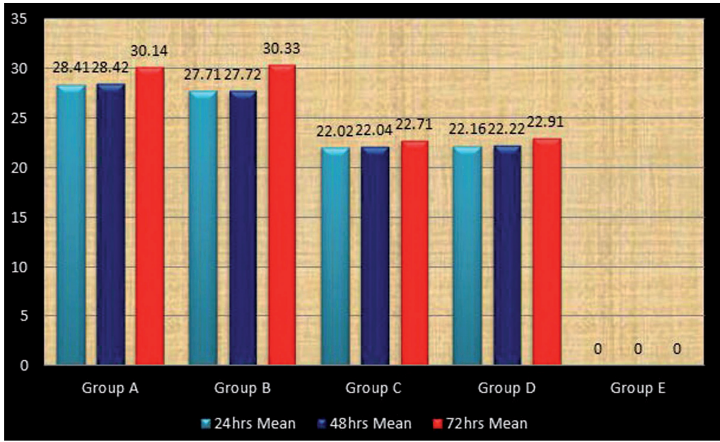
Fig. 2: Multiple inter group comparison after 72 hour.

Not Significant: p > 0.05. highly significant: p < 0.001***.