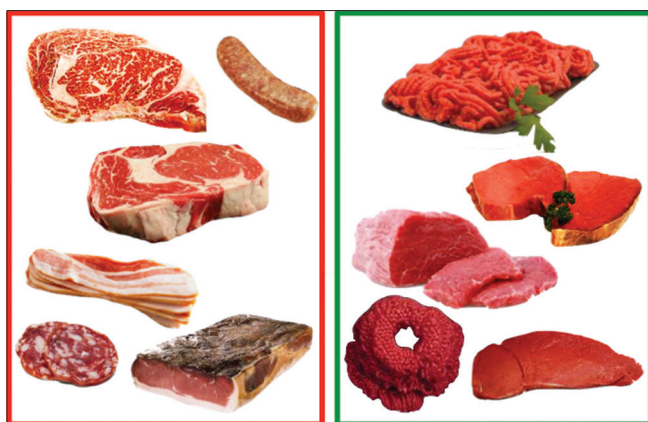
Figure 1: Meats rich in visible fat and preservatives (red box on the left) have been demonstrated to increase cardiovascular risk while lean fresh red meat (green box on the right) has not