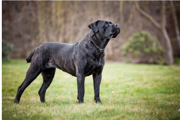
Fig. 1. Photograph of a Cane Corso Italiano dog (Koleta Atison, Evžen Korec’s archive).

We obtained data on 232 deceased dogs from 73 kennels and individual owners from 25 countries (Australia, Belgium, Bosnia and Herzegovina, Bulgaria, Canada, Czech Republic, Estonia, France, Germany, Greece, Hungary, Israel, Italy, Latvia, Macedonia, Montenegro, Netherlands, Poland, Russia, Serbia, Slovenia, Spain, Turkey, Ukraine, USA).