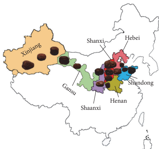
FIGURE 1: The cultivation areas and major production areas of jujube in China. The cultivation areas of jujube in China were highlighted and shown. The insert shows the location of major production areas of China, including Xinjiang, Gansu, Shaanxi, Shanxi, Hebei, Henan, and Shandong provinces. Shaanxi and Shanxi are considered as the original cultivation areas of jujube.

mental tension. Clinically, jujube is commonly prescribed, either as single herb or in tranquilizing formulae combined with other herbal medicines, for the treatment of insomnia and forgetfulness. Previous reviews have summarized the fruit composition and its health benefits [10, 11]. However, the studies focused on neuroprotective activities are rather limited. Therefore, the neurobeneficial roles of jujube will be introduced in this review. In addition, the potential bioactive compounds of jujube related to brain benefits are further discussed.