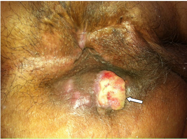
Fig. 1. Peri-anal fistula before surgery.