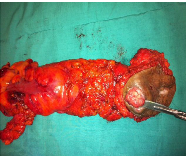
Fig. 3. Surgical specimen.