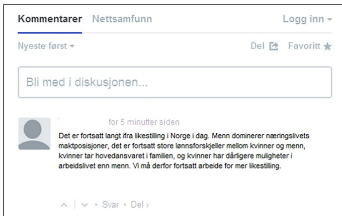
Figure I. Stimuli was presented in the format of online debates.

gender equality should continue and 10 indicates that gender equality has gone too far, where will you place yourself? Several questions on use of Facebook and then Twitter were asked between the general gender equality question and the experiment. Immediately after the experiment and the follow-up questions (see above), we repeated the general gender equality question.