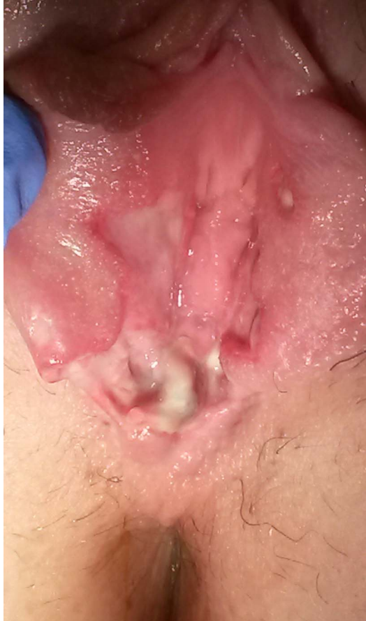
Figure 2 Multiple vulvar ulcers (first day after starting topical clobetasol).

<sup>1</sup>Department of Gynecology and Obstetrics, Centro Hospitalar do Algarve—Faro, Faro, Portugal <sup>2</sup>Department of Gynecology and Obstetrics, Centro Hospitalar do Algarve— Portimão, Portimão, Portugal