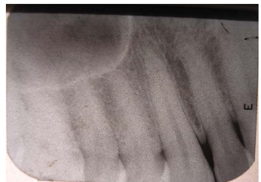
Figure 2 Periapical radiograph showing 24, 25 and 26.

Intraoral periapical radiograph in relation to 24, 25 and 26 did not reveal any pathological changes.