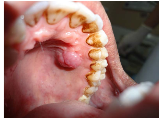
Figure 1 Intraoral view.

A 31-year-old man presented with a growth on the left anterolateral part of the hard palate of 3 years' duration with a complaint of discomfort during mastication and speech. The growth was the size of a peanut when he first noticed it 3 years previously and had grown to the present size. The growth was asymptomatic; there was no history of pain, pus discharge or bleeding, or any other secondary symptoms. His medical dental and family history was non-contributory.