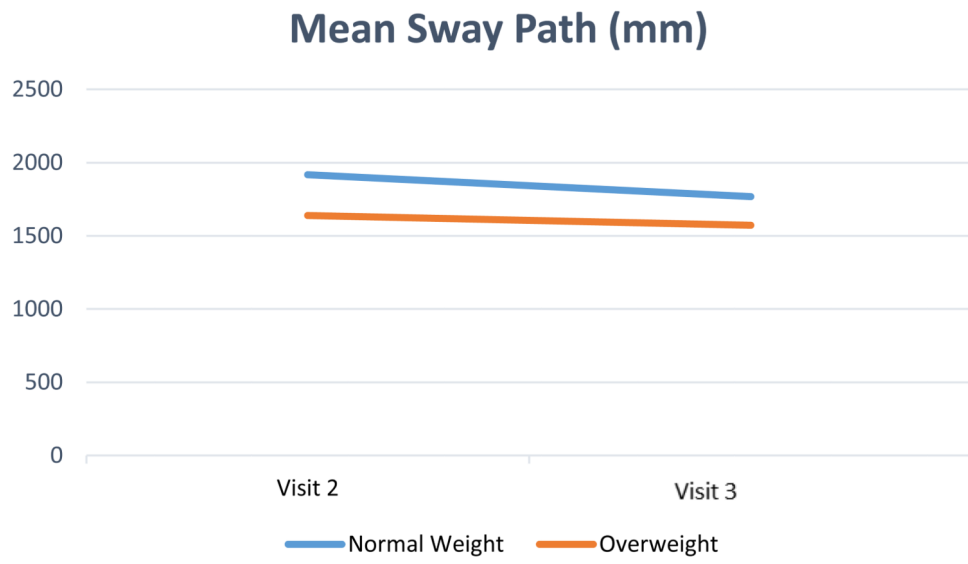
Fig. 2. Sway Path