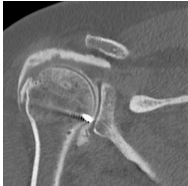
Fig. 3 Postoperative arthroscanner shows the bony integration of the Achilles-calcaneal allograft, and a good integration of posterosuperior tendinous graft

presented here offers an opportunity to perform an effective conservative surgery for well-selected young patients with shoulder pseudoparalysis.