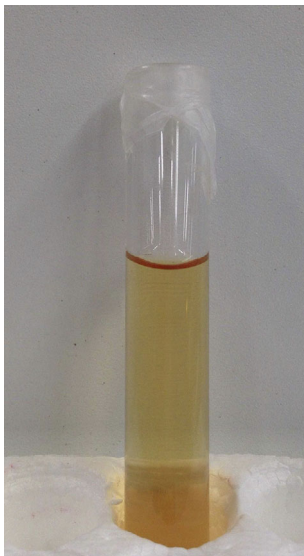
Figure 1. The color of the urine was brown but not dark.

eGFR: estimated glomerular filtration rate