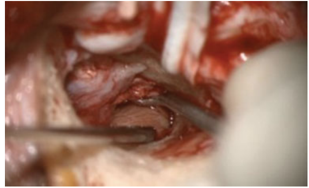
Fig. 3 Middle ear tumor.

The treatment of choice for middle ear adenomatous tumors is surgical (► Fig. 3 ), with the surgical approach performed in