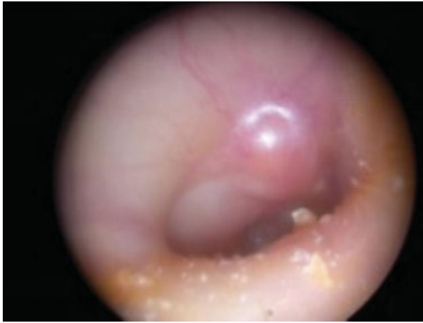
Fig. 1 Otomicroscopy of a right ear shows a middle ear mass medial to an intact tympanic membrane (courtesy of Thomas E. Linder, Kantonsspital Luzern, Luzern, Switzerland).

metastases (cervical mass, systemic symptoms) should include images of the neck, chest and abdomen. Researchers concluded that the octreotide scan is a sensitive method for monitoring through in cases of both recurrence of carcinoid ears and metastases, but there is no evidence for its use in the preoperative diagnosis and evaluation of these tumors. 12 Immunohistochemical staining can be a useful tool in differentiating adenomatous middle ear tumors from other neuroendocrine tumors, such as paraganglioma. The absence of S-100 protein positivity, combined with a strong positive staining for keratin, strongly argues against a diagnosis of paraganglioma. Immunostaining for galanin may also be useful, because carcinoid tumors have proved to be galanin negative, whereas some paragangliomas have been found to be galanin positive. 13,14