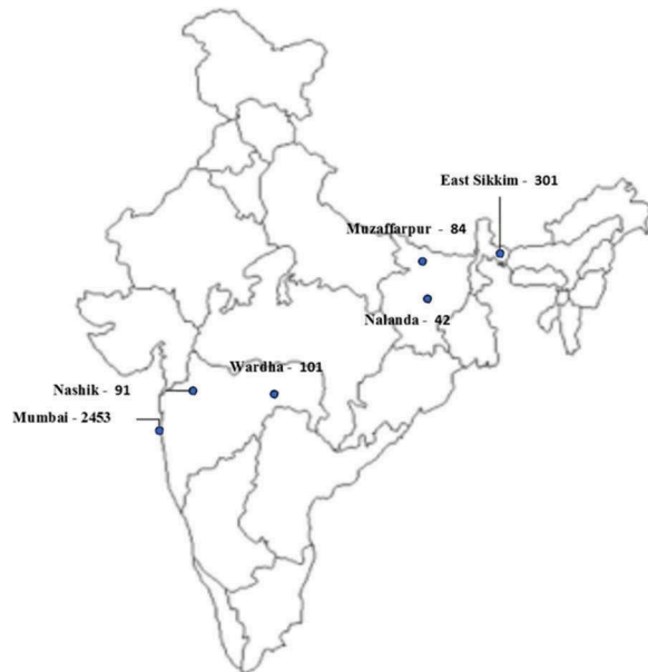
Figure 1. Location of districts covered under the study.