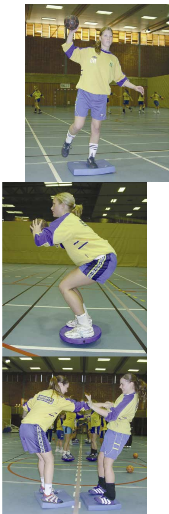
Fig 1 Top: mat exercise. Middle: wobble board exercise. Bottom: mat pair exercise