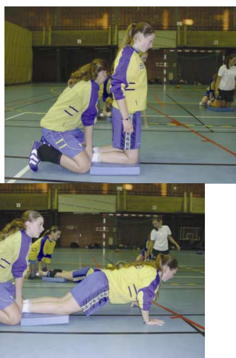
Fig 2 Example of a strength exercise (“Nordic hamstring lowers”). Top: start position; a partner holds around the player’s ankles. Bottom: The player falls slowly forwards, using hamstrings to resist the fall against the floor as long as possible

relative risk of the number of injured players according to the intention to treat principle to compare the risk of an injury in the intervention and control groups. Cox regression was our analysis tool for the primary outcome as well as the secondary outcomes, and we used the robust calculation method of the variance-covariance matrix, 16 taking into account the cluster randomisation. We tested rate ratios with Wald’s test. We used one way analysis of variance to estimate the intraclass correlation coefficient to obtain estimates of the inflation factor for comparison with planned sample size. We used the inverse of the difference between percentages of injured players in the two groups to calculate the number needed to treat to save one injury. We calculated exposures to training and matches and incidence of injury as described in our earlier study.