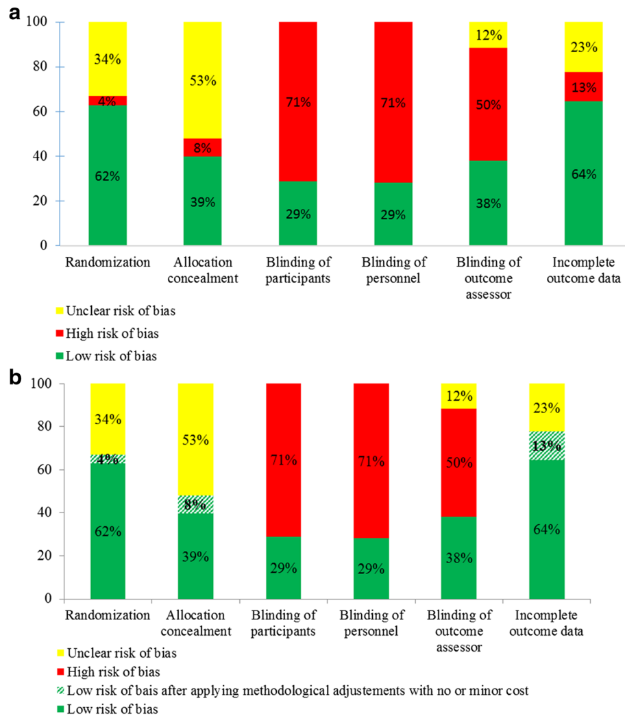
Fig. 2 Risk of bias in 121 randomized controlled trials (RCTs) performed in Sub-Saharan Africa. Initial risk of bias (a) and risk of bias after applying easy methodological adjustments with no or minor additional cost (b). Vertical bars represent domains assessed according to the Risk of Bias tool of the Cochrane Collaboration