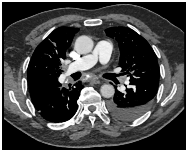
Figure 1 CT scan showing a soft tissue mass with multiple areas of calcification, causing narrowing of the right pulmonary artery. A left-sided small pleural effusion is also present.

subsequently underwent right heart catheterisation which showed a mean pulmonary artery pressure of 31 mm Hg, pulmonary wedge pressure of 10 mm Hg and pulmonary vascular resistance of 512 \text{ dynes}\cdot\text{sec}\cdot\text{cm}^{-5} in keeping with precapillary pulmonary hypertension.