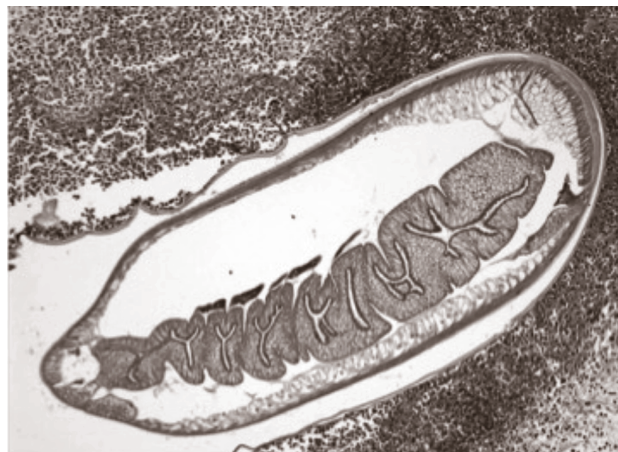
Fig. 2 - At higher magnification can observe the anatomical details of the parasite: a thin external cuticle overlying a muscle layer and intestine composed of a single layer of columnar epithelium forming a central tripartite lumen (100x, E&E)

(10). In literature, some studies report also the possibility of using Anisakis ' antibodies to improve the differential diagnosis (11). Concerning treatment, there are cases of successful medical treatment with prednisolone and olopatadine hydrochloride avoiding hospitalization (7) and other cases of endoscopic treatment avoiding surgical procedure (12).