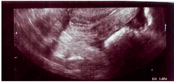
Fig. 1. — Endometrial thickness on day of HCG injection in a woman on clomiphene citrate plus sildenafil vaginal gel (7 th cycle). Note the triple line endometrium