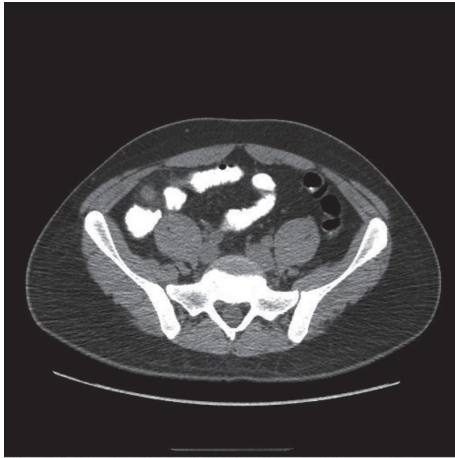
FIGURE 1: Axial section of abdominal CT scan with contrast demonstrating swollen appendix with 9.8 mm diameter, no appendicolith present.