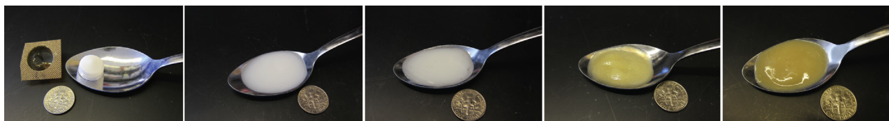
Figure 2. Disintegration of lopinavir/ritonavir FDTs in 2 mL of different fluids. From left to right: FDT; tablet dissolved in water, milk, applesauce, and banana sauce.

As noted above, currently available ODTs developed using freeze-drying disperse rapidly in liquids but are fragile. The robust freeze-dried FDT we developed with an LPV/r has attributes of a solid-dosage form, including compact packaging and easy handling by caregivers. It also provides the advantages of a liquid formulation, because the highly porous structure allows rapid disintegration in a small volume of fluid for administration—which also permits dispensing portions of the fluid to provide appropriate doses for children of different weights. The use of freeze-drying for developing FDTs has some limitations. High drug loading in small volumes can result in a viscous formulation, which allows air bubbles to form during mixing and interferes with uniform filling of the blister cavities and nonuniformity in the final product. In addition, high levels of surfactants can cause foaming during lyophilization, resulting in spillage of material from blisters and