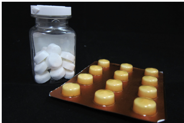
Figure 1. Lopinavir/ritonavir FDTs.

(GPR Centrifuge; Beckman Coulter, Indianapolis, IN) to separate the food contents. Supernatants were collected and injected into the chromatographic system.