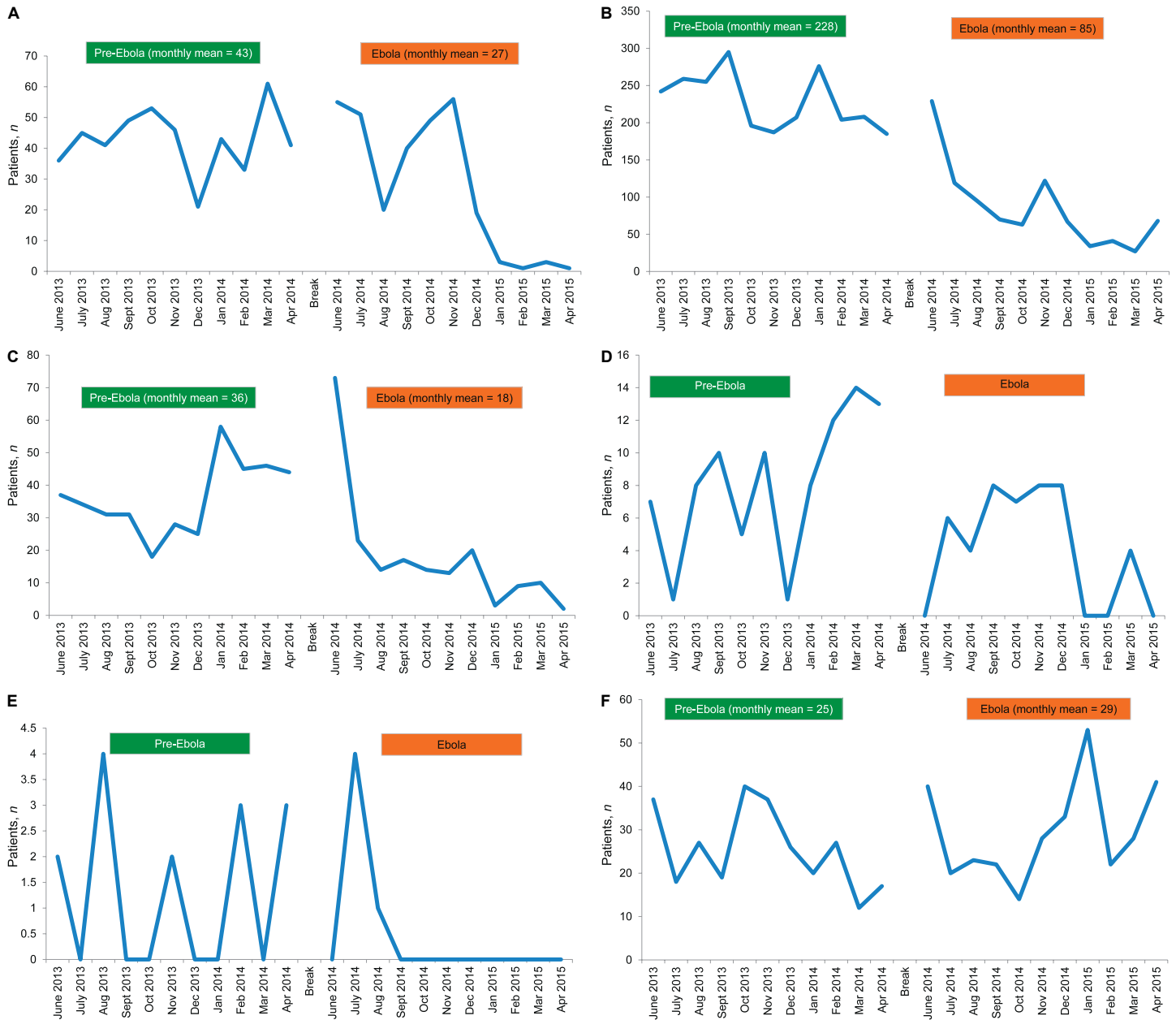
FIGURE 2 A) Cardiovascular disease. B) Hypertension. C) Diabetes mellitus. D) Cancer/tumour. E) Mental health disease. F) Peptic ulcer disease. Numbers of patients reported each month with a different NCD at health facilities in the pre-Ebola and the Ebola periods, Western District, Sierra Leone, 2013–2015. Pre-Ebola period = 1 June 2013–30 April 2014; Ebola period = 1 June 2014–30 April 2015. NCD = non-communicable diseases.

available only from the public health facilities, we could not report on the NCD trends in private health care settings. The representative health facilities, especially the PHUs, were selected based on convenience sampling, and there may thus be some inherent bias that could have led to an overestimation or underestimation of the extent of the decrease in the reported NCDs. Many patients with MHD may also have attended the mental health hospital, which was not included in the representative sample for the study.