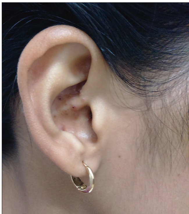
Figure 1: Multiple erythematous papules on right pinna

disease as well as to prevent the recurrence. All papules healed without scarring and there was no recurrence on 1 year follow up [Figure 3].