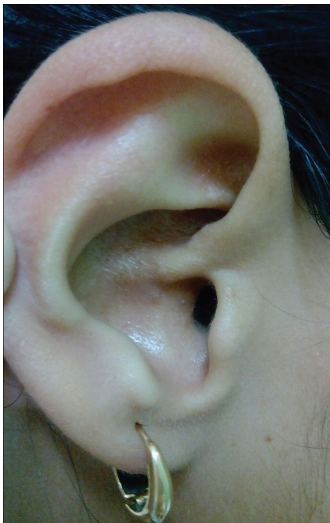
Figure 3: Resolution after combination therapy of RFA and timolol

cutaneous or mucosal necrosis, and sensory nerve or motor nerve injuries such as facial paralysis. [6] Intralesional RFA has also been tried for nodular ALHE. [5] However, it is a blind procedure and cannot be performed in areas where important structures such as major nerves and vessels lie in the vicinity of or within the lesion. [5]