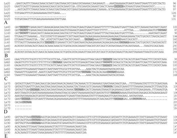
Fig 3. Alignment of 5'UTRs of Liriomyza hsp genes. The TATA-box-like elements are indicated by shading and the dots indicate alignment. Abbreviations are identical to those in Fig 1. Panels: (A) hsp20 ; (B) hsp40 ; (C) hsp60 ; (D) hsp70 ; and (E) hsp90 .

https://doi.org/10.1371/journal.pone.0181355.g003