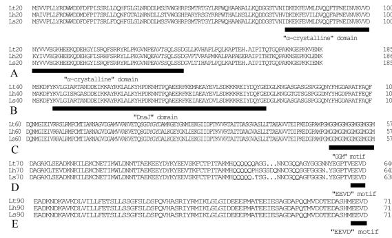
Fig 1. Salient features of five genes encoding HSPs in Liriomyza spp. The amino acid sequences of the deduced protein products of hsp20 (A), hsp40 (B), hsp60 (C), hsp70 (D) and hsp90 (E) were aligned and conserved motifs or domains are indicated. Dots (.) indicate alignment. Abbreviations: Lt20, L. trifolii hsp20 ; Lh20, L. huidobrensis hsp20 (DQ452370.1); Ls20, L. sativae hsp20 (DQ452371.1); Lt40, L. trifolii hsp40 ; Lh40, L. huidobrensis hsp40 (DQ452364.1); Ls40, L. sativae hsp40 (DQ452365.1); Lt60, L. trifolii hsp60 ; Lh60, L. huidobrensis hsp60 (AY845949.2); Ls60, L. sativae hsp60 (AY851366.2); Lt70, L. trifolii hsp70 ; Lh70, L. huidobrensis hsp70 (AY842476.2); Ls70, L. sativae hsp70 (AY842477.2); Lt90, L. trifolii hsp90 ; Lh90, L. huidobrensis hsp90 (AY851367.2); and Ls90, L. sativae hsp90 (AY851368.2).

https://doi.org/10.1371/journal.pone.0181355.g001