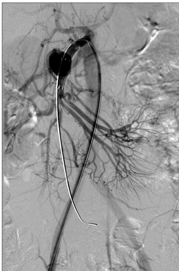
Figure 2. Control DSA showed persistent aneurysmal sack filling after implantation of self-expandable covered stent due to incomplete aneurysmal neck covering.

expandable cobalt-chromium covered stent (E-ventus BX ® , Jotec, 8×50 mm) was placed in the SMA, covering the aneurysmal neck (Figure 3). A control DSA confirmed a complete exclusion of the aneurysm.