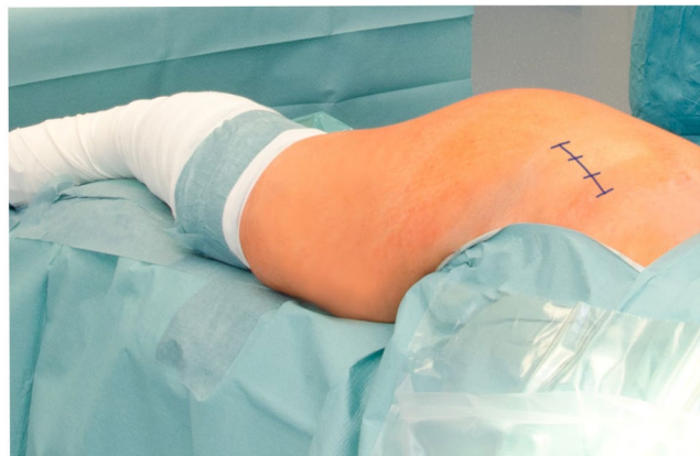
Figure 1. Patient position and skin incision of minimally invasive THA through an anterolateral approach in the lateral decubitus position.