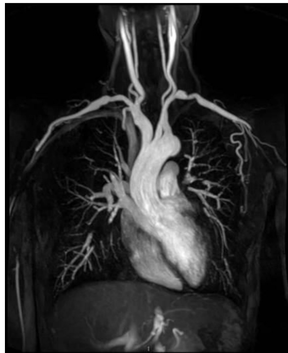
Fig 1. Bilateral subclavian artery stenosis. Coronal reconstruction of magnetic resonance angiogram shows noncalcified stenosis of bilateral subclavian arteries suggestive of Takayasu arteritis.

In 2005, at the age of 25 years, she developed bilateral lower extremity claudication. Physical examination revealed normal and symmetric radial pulses, but an abdominal bruit was present on auscultation and femoral pulses were not palpable. Computed tomography angiography revealed extensive calcification of her