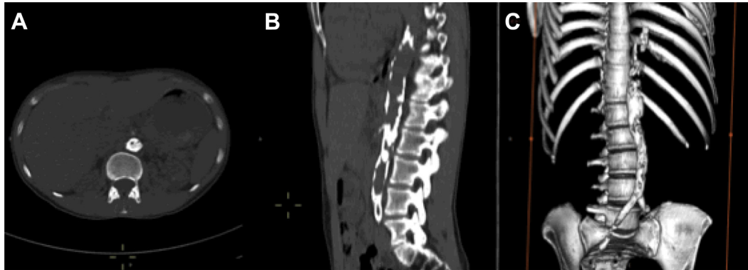
Fig 2. Calcification of the abdominal aorta. Images from a non-contrast-enhanced computed tomography scan of the chest, abdomen, and pelvis. A , Axial view shows extensive calcification of the abdominal aorta with severe narrowing of the lumen of the aorta. B , Sagittal view shows the distribution of calcification throughout the abdominal aorta. C , A three-dimensional reconstruction shows the extent of calcification starting at the distal thoracic aorta and extending into the iliofemoral arteries.

In 2009, she returned with disabling claudication, unable to walk more than 5 meters without rest. Whereas her inflammatory markers continued to be normal, she was severely osteopenic on dual-energy X-ray absorptiometry scan and was started on 2 g of calcium carbonate per day. Computed tomography angiography revealed progression of her aortoiliac calcification, now with near-occlusion of her bilateral common iliac arteries. She underwent bilateral common iliac artery angioplasty and stenting, resulting in normal pedal pulses and complete resolution of her symptoms.