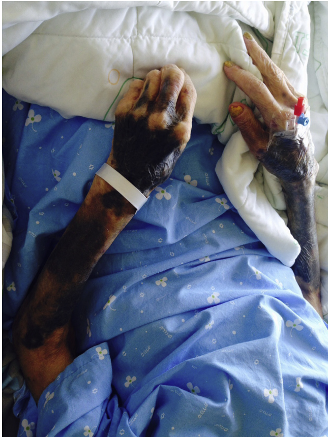
Fig. 1. Well-circumscribed blue-grey skin pigmentation.

showed large left pleural effusion. Transthoracic echocardiogram displayed normal left ventricular chamber size with normal systolic