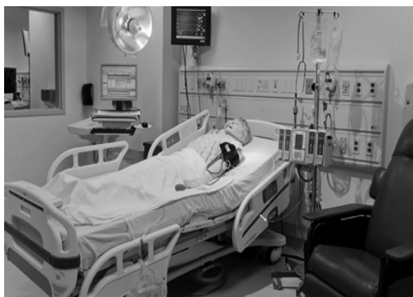
Figure 1 A SimMan 3G Mannequin (Laerdal Medical Ltd, Orpington, UK) at the J. Wayne and Delores Barr Weaver Simulation Center at the Mayo Clinic in Jacksonville, FL, USA. The room is equipped with all the necessary supplies to simulate real-life scenarios to ensure optimum training.

Outcome measures for this study were the differences in pretest, post-test, and realism scores between the SP and mannequin groups.