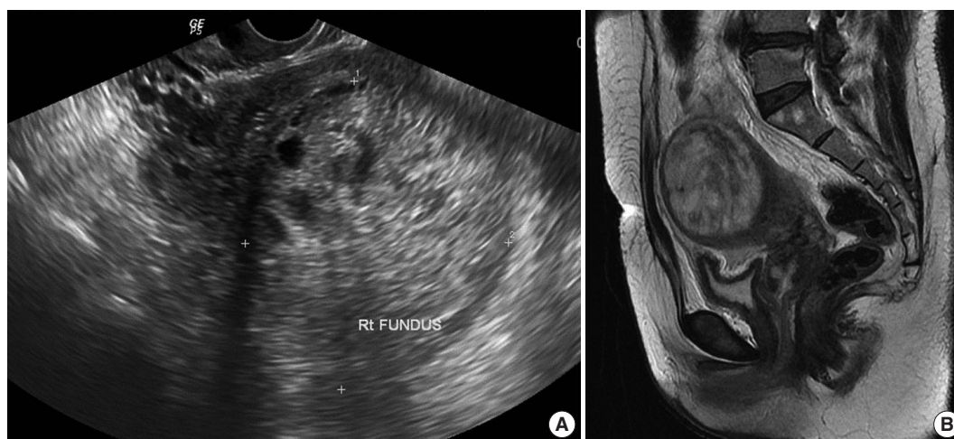
Fig. 1. Radiologic findings. (A) Pelvic ultrasonography, showing an enlarged uterus with a 7-cm solid and cystic mass. (B) T2-weighted magnetic resonance imaging, showing an enlarged uterus with a mass, measuring 71 × 59 × 72 mm, arising from the uterine fundus.

These microscopic findings suggested that the tumor was a mixed epithelial-stromal tumor consisting of glandular cells without atypia (benign endometrial hyperplasia) and sarcomatous stromal cells with mild pleomorphism and a high mitotic rate