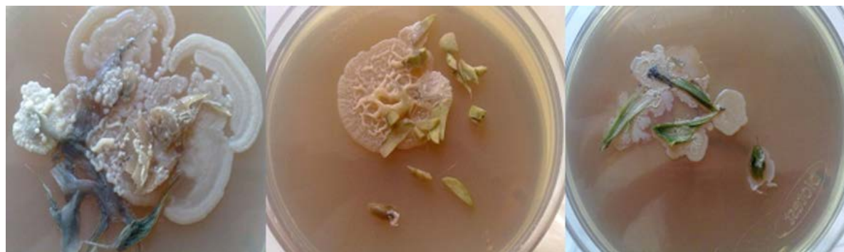
Fig. 1. Colonies of endophytic bacteria grown on R3A culture medium

Antimicrobial susceptibility. Using the plant tissues crushed and cultured in Petri dishes, plant-associated bacteria were successfully isolated (Fig. 1).