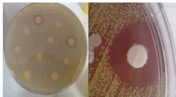
Fig. 2. Antimicrobial susceptibility test of endophytic bacteria

Identification of bacteria. We sequenced and performed phylogenetic analysis of 23 bacterial isolates obtained from 23 plants. The results of phylogenetic analysis of 16S rRNA (Table 2 and Fig. 3) showed that our isolates belonged to different bacterial species, including Gram negative (such as Pseudomonas graminis ) and Gram positive bacteria (such as Ba-