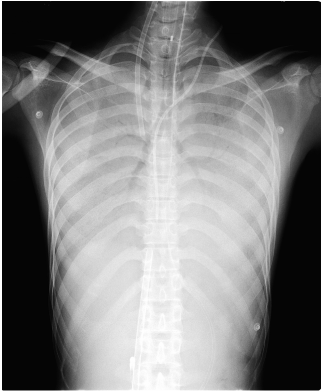
Figure 1 Chest X-ray on the day of extracorporeal membrane oxygenation initiation (intensive care unit day 3).