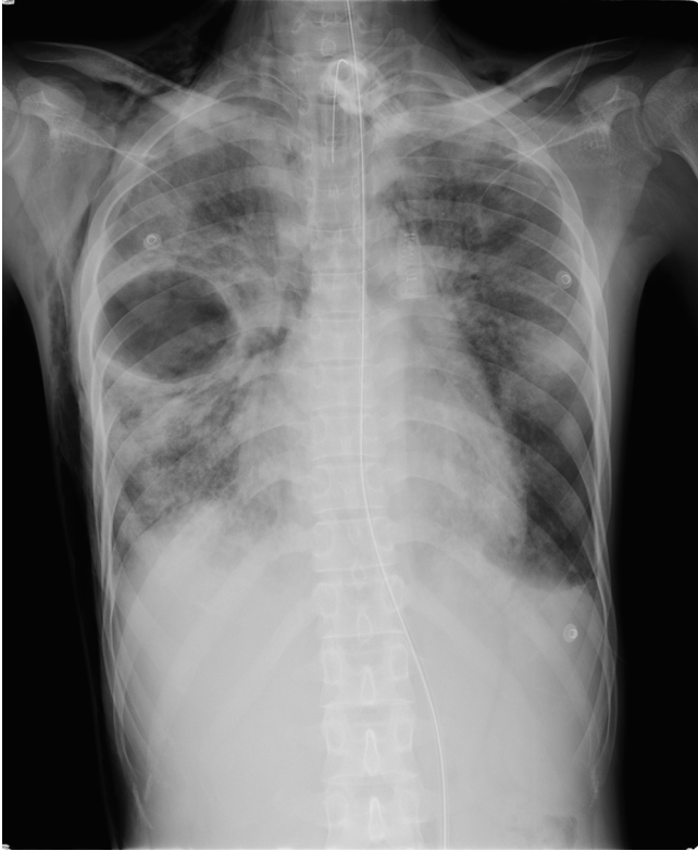
Figure 3 Chest X-ray when the patient progressed re-worsening of respiratory status and requiring the second session of extracorporeal membrane oxygenation (intensive care unit day 17).