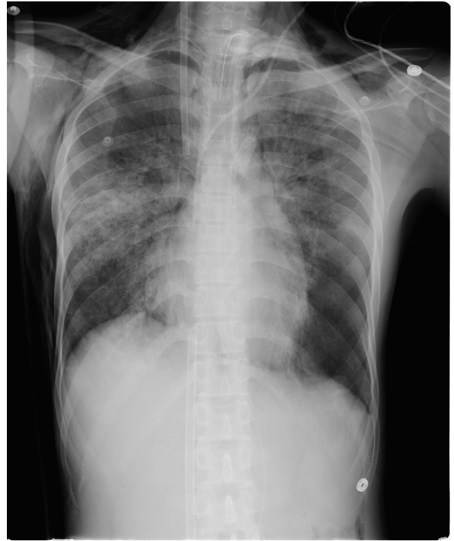
Figure 2 Chest X-ray on the day of termination of the first extracorporeal membrane oxygenation session (intensive care unit day 15).

the treatment of PjP with corticosteroids and TMP/SMX were continued. Blood and sputum cultures suggested no bacterial involvement, and antibiotics (meropenem, vancomycin and ciprofloxacin) were discontinued after 2 weeks.