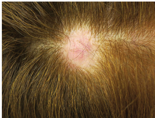
Figure 1 A smooth, alopecic nodule on the right parietal scalp diagnosed as alopecia neoplastica.

scalp, which had been present for a few months and was notable for complete loss of the overlying hair (figure 1). MRI of the brain showed greater than 10 diffusely enhancing lesions suspicious for metastatic disease, with a dominant left parietal haemorrhagic lesion measuring approximately 2.8×2.9×2.2 cm (figure 2). Associated vasogenic oedema resulted in an 8 mm midline shift. Punch biopsy of the scalp nodule revealed malignant melanoma in the dermis staining positive for Melan-A and S100. A BRAF codon V600K missense mutation was detected. Left parietal craniotomy was performed for mass resection, and the patient subsequently received chemotherapy, Gamma Knife radiation, and targeted therapy with the BRAF inhibitor dabrafenib and the MEK inhibitor trametinib. Unfortunately, the patient did not respond to treatment and passed away from complications of metastatic melanoma.