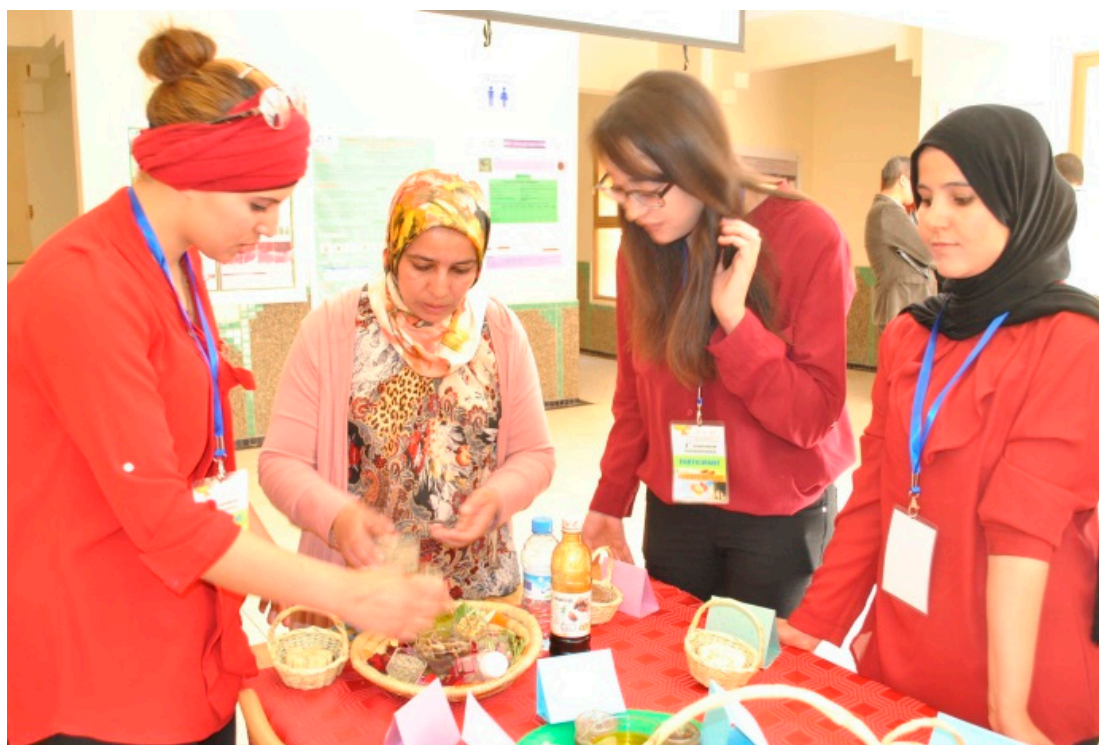
Figure 2. Presentation of food products and cosmetics with bases of Argan oil.