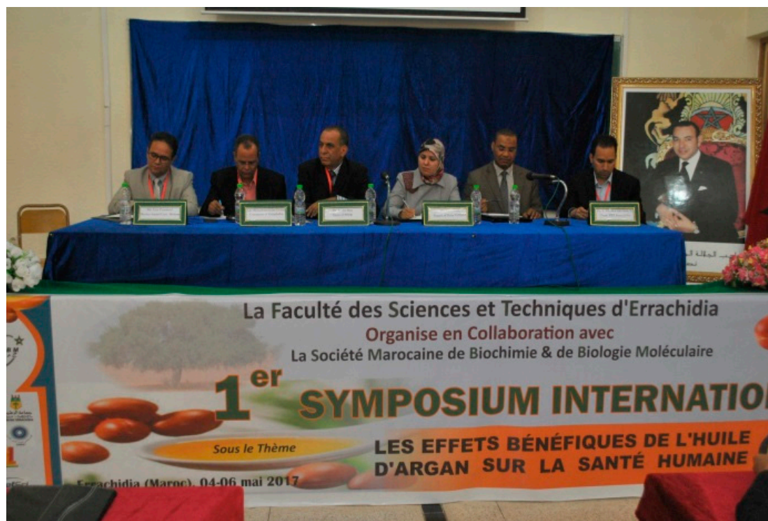
Figure 1. Opening session of the 1st symposium on argan oil by the officials.