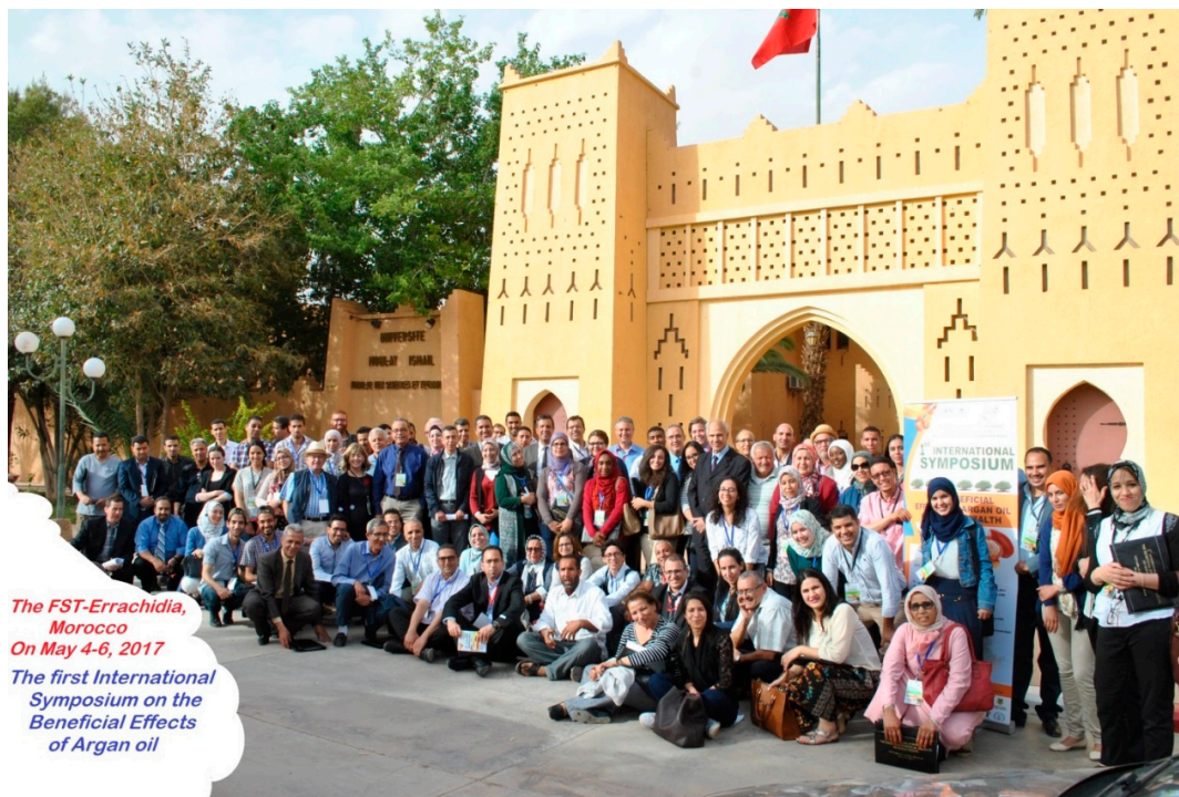
Figure 5. Symposium participants.