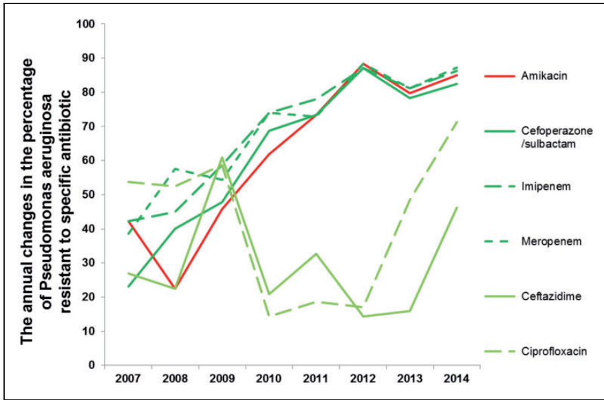
Figure 3. Annual changes in the percentage of P. aeruginosa resistant to specific antibiotics from 2007 to 2014.

The percentage (%) of P. aeruginosa resistant to specific antibiotics was measured by the Kirby–Bauer disk diffusion method. Red lines represent antibiotics commonly used against Gram-negative bacteria, green lines represent antibiotics with antibacterial activities against both Gram-positive and Gram-negative bacteria. Dark colors indicate significant changes in trends, light colors indicate non-significant changes in trends.