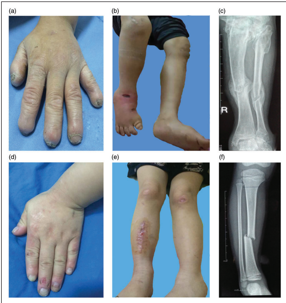
Figure 1. Clinical features of patient 1 (a–c) and patient 2 (d–f). (a) Hyperkeratosis, missing tips, and deformed nails from self-mutilating behaviour. (b) Ankle deformity and ulcer of the right foot. (c) Previous radiograph of old fractures of the right tibia and fibula. (d) Hand showing signs of self-mutilation. (e) Scars on the right leg. (f) Previous radiograph of a fracture of the right tibia.

‘earliest’ stop-gain mutation identified in NTRK1 in Chinese CIPA patients. The splice-site mutation (c.851-33 T > A), also known as IVS7-33 T > A, has previously been reported in Japanese, Korean, and Chinese patients with CIPA. The transition from T to A at the fourth position of the branch site in intron 7 severely reduces the