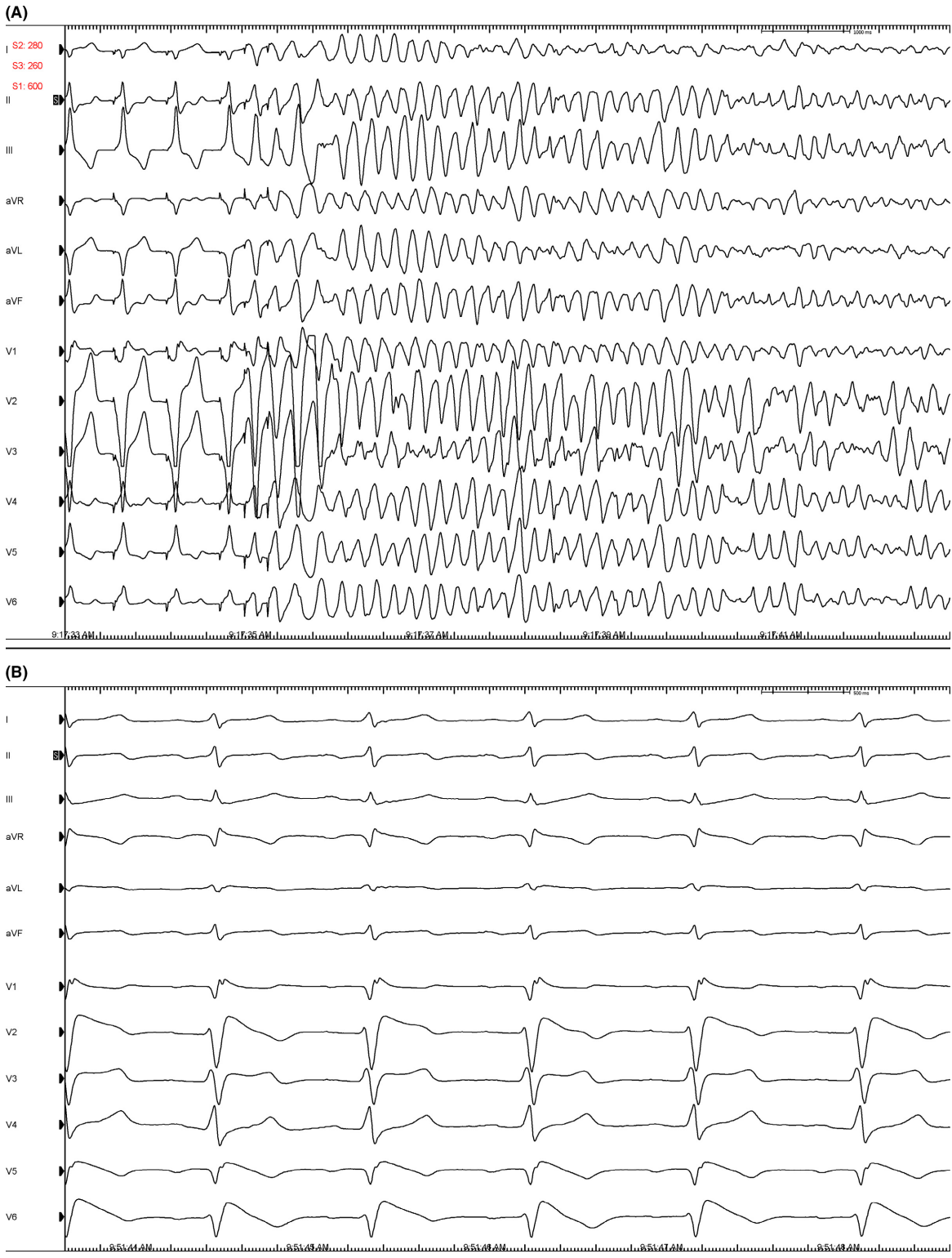
Figure 2. (A) VF induction with ventricular double extrastimuli. (B) CardioLab tracings showing provocation of type 1 Brugada pattern with procainamide infusion.