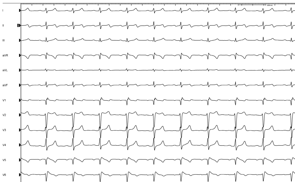
Figure 1. Electrocardiogram of our patient showing concern for type 2 Brugada pattern, baseline bradycardia, and long QT interval.

To date, there have been few reports describing clinical experiences of overlap between LQT3 and Brugada syndrome. In the National Heart Lung Blood Institute (NHLBI) Exome Sequencing, the c.5350G>A; p.Glu1784Lys missense mutation in the SCN5A gene has