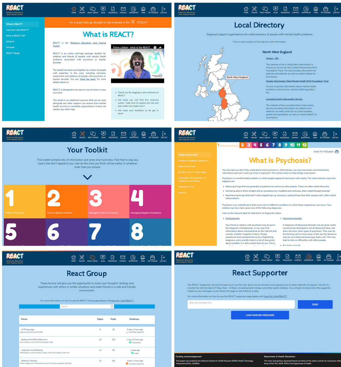
Figure 2 Screenshots to show look and feel of the Relatives Education And Coping Toolkit website.