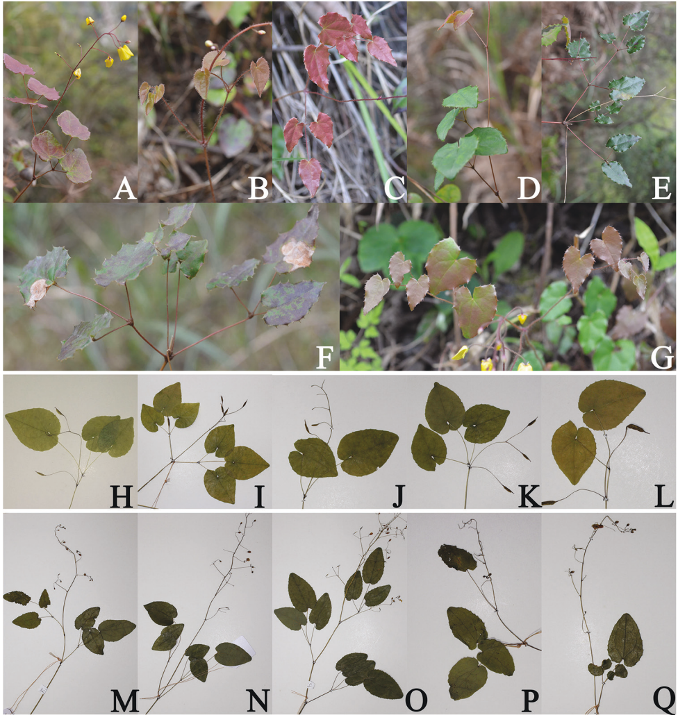
Figure 3. Population variation of leaves morphology in E. ecalcaratum , E. platypetalum , and E. campanulatum . A-G E. ecalcaratum H-L E. platypetalum M-Q E. campanulatum .

of the leaves and the number of leaflets varies in this species. Upon extensive specimen examination, Zhang et al. (2011, 2015b) observed that the leaves of E. simplicifolium T. S. Ying were mainly unifoliate, occasionally trifoliate, and the leaves of E. acuminatum Franch. may be unifoliate. Subsequently, E. simplicifolium was synonymized with E. acuminatum (Zhang et al. 2011). Hence, as a taxonomist, it is important to study as many collections as possible (Xu 1998).